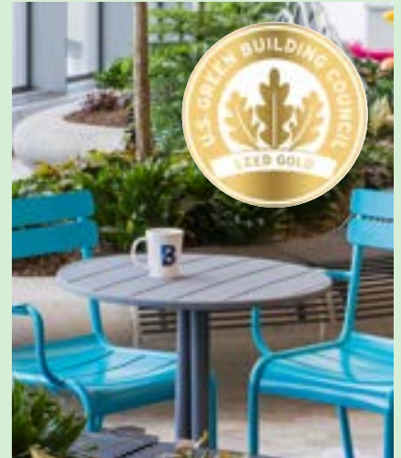
One of Terminal B's parks.

The Envision Award recognizes sustainability in multiple areas, including human well-being, mobility, community development, collaboration, planning, economic development, materials, energy, water, conservation, ecology, emissions, and resilience.