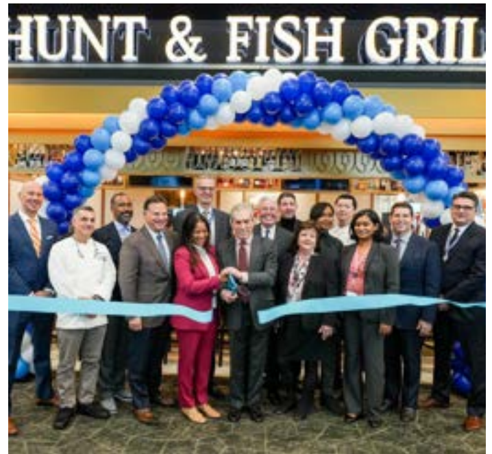
Hunt & Fish Grill