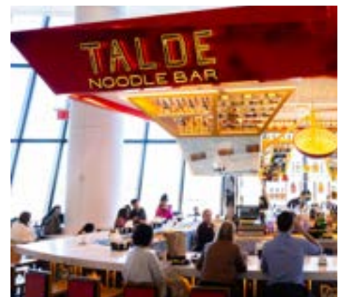
Talde Noodle Bar