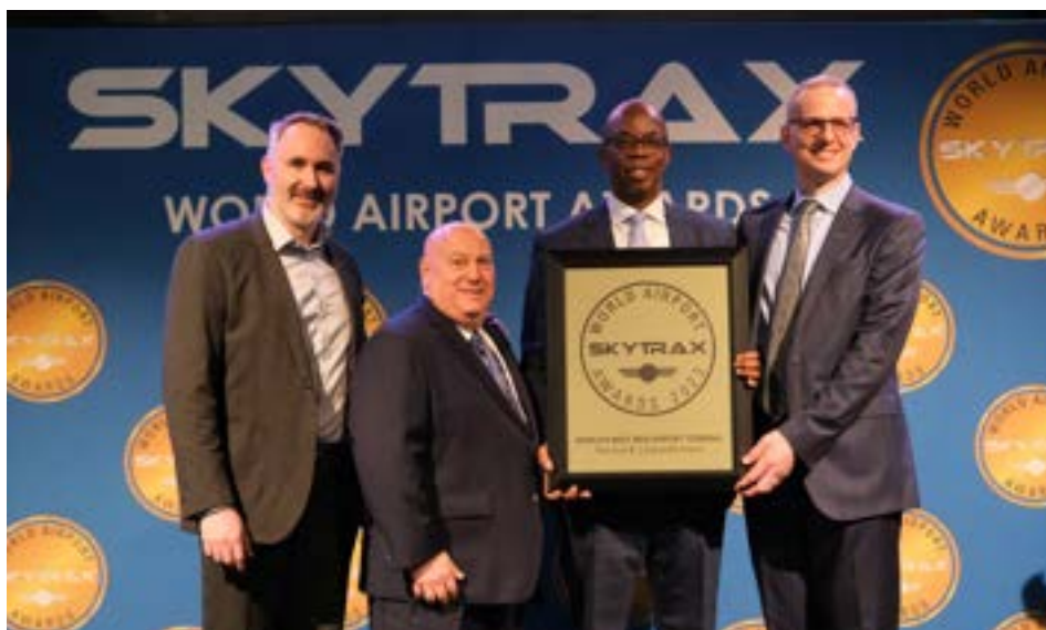
Executives from LaGuardia Gateway Partners and the Port Authority of New York and New Jersey at the World Airport Awards ceremony in Amsterdam.