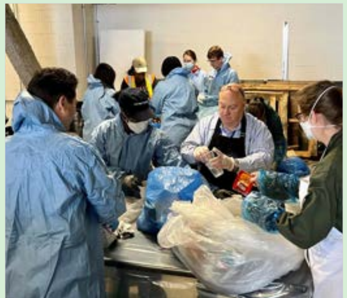
LGP team members at Terminal B's waste audit.

Understanding our waste has allowed us to prioritize which initiatives to focus on to continue to grow our waste diversion rate. These includes focusing on diverting liquids out of the waste stream through new