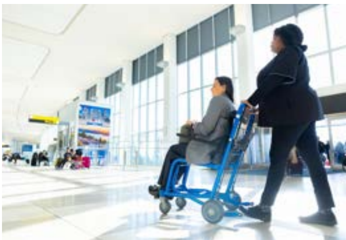
One of Terminal B's wheelchair associates assisting a guest.

The RHFAC program helps organizations understand their level of meaningful accessibility from the people-centric perspective of those with varying disabilities. Using common methodology and language, it provides a road map on how to improve, helps organizations prioritize decision making based on data and celebrates achievements in their journey towards improved access. Over 1,800 sites have been rated through the program to-date with over 1,300 becoming certified.