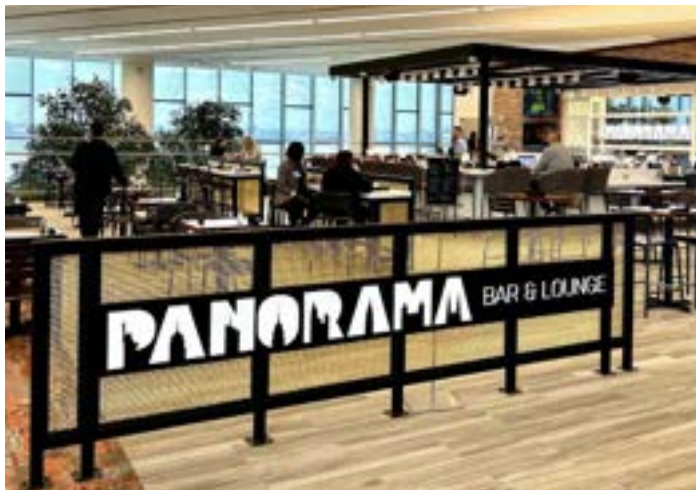
Panorama Bar & Lounge

Meditation Room: Terminal B's new Meditation Room is now open. Located on Level 4, the space offers a quiet place for reflection.