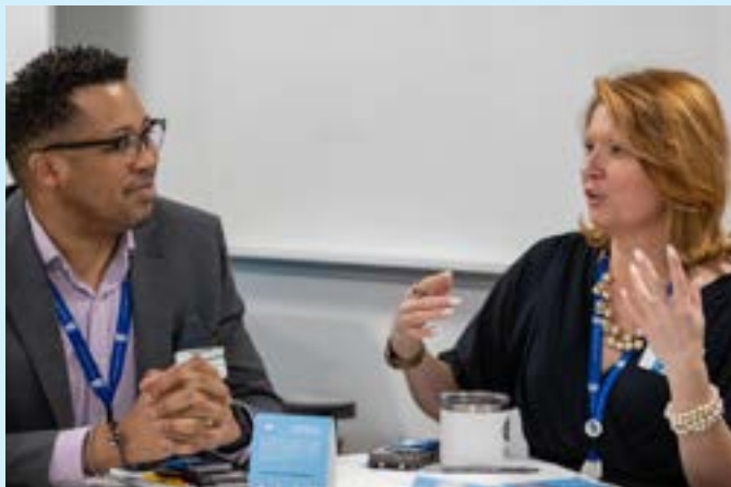
Terminal B leaders collaborating and ideating at our Guest Experience Summit

In 2023, Terminal B held its first ever Guest Experience Summit. Attended by leaders across the Terminal, the Guest Experience Summit was a first of its kind gathering to align the entire terminal community around our mission – to deliver an exceptional experience everyone