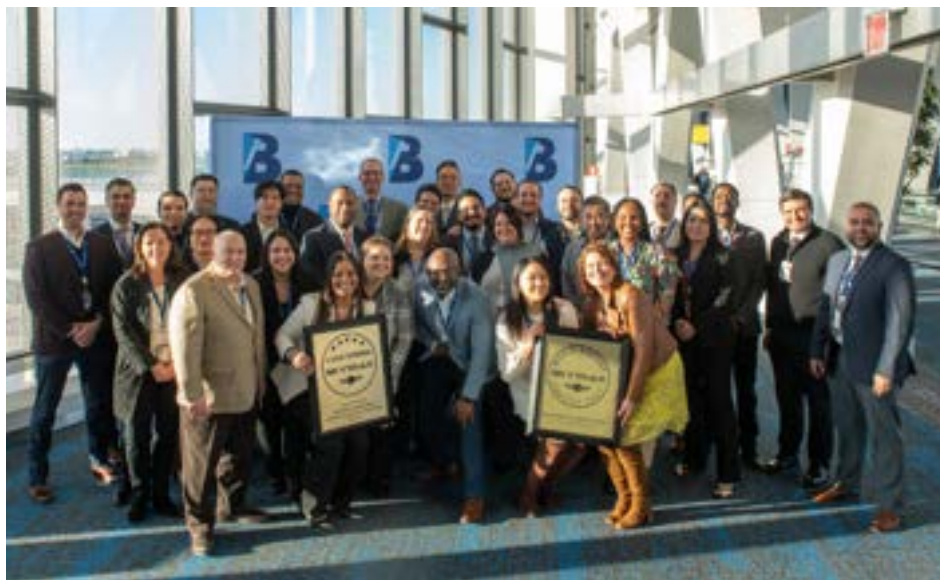
LaGuardia Gateway Partners team members pose with the awards.

Skytrax also named LaGuardia Terminal B The World's Best New Airport Terminal at the 2023 World Airport Awards. Referred to as the Oscars of the airport industry, the World Airport Awards are regarded as a quality benchmark for the world airport industry, assessing customer service and facilities across more than 550 airports.