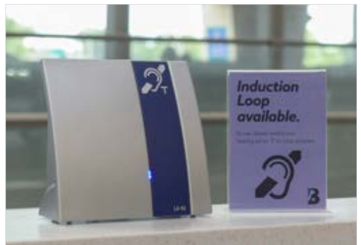
Terminal B's hearing loop technology.