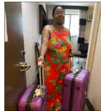
Residents of Care for the Homeless move into their new homes with their luggage.