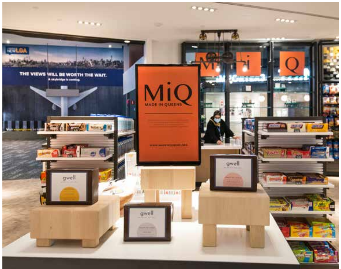
Queens Corner in the Bowery Bay Shops proudly features merchandise created in Queens.

We are excited to showcase Queens to the millions of passengers who pass through our terminal each year!