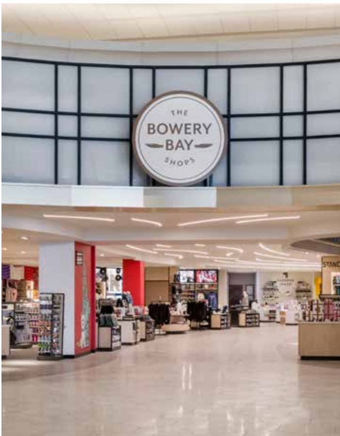
Rotating pop-up shops at Bowery Bay features unparalleled sensory experiences designed to enhance the customer journey and give travelers first-hand access to an endless assortment of products and services.