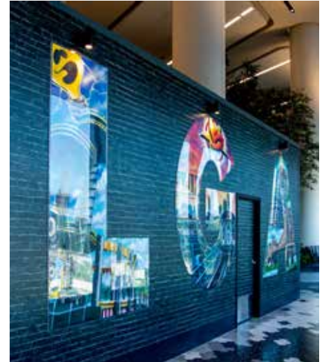
Our Western Concourse also features a unique piece of art entitled "A Queens Tribute" by Meres One.

Last but certainly not least is our Water Feature. Our Iconic New York show is projected onto the water