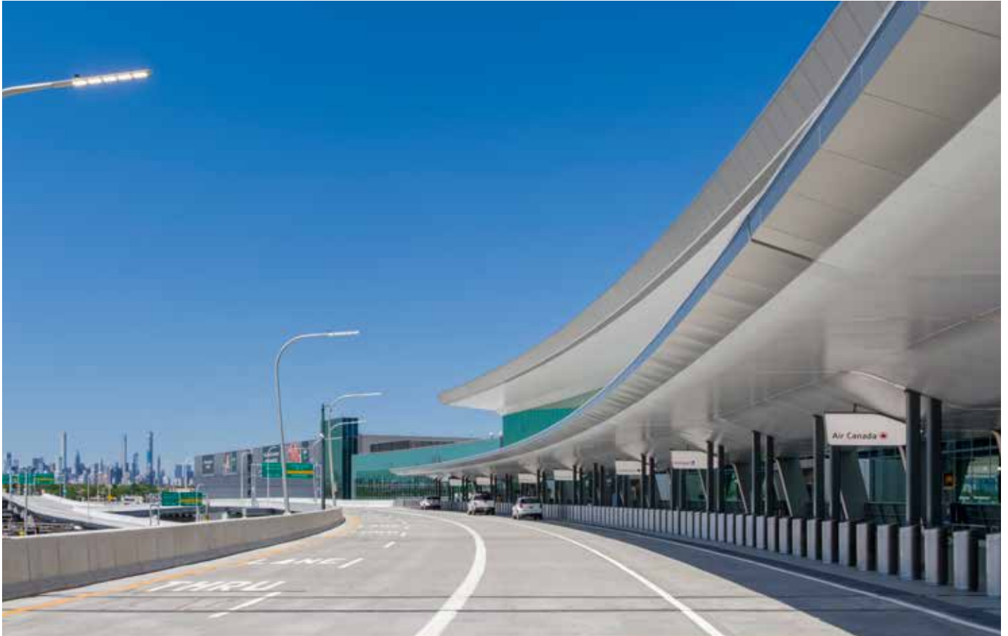
Terminal B Arrivals and Departures Roadways