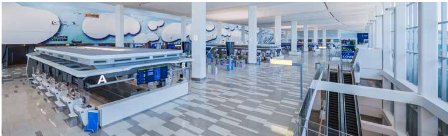
Terminal B Arrivals and Departures Hall – Level 3

Click here for a virtual tour of Terminal B.